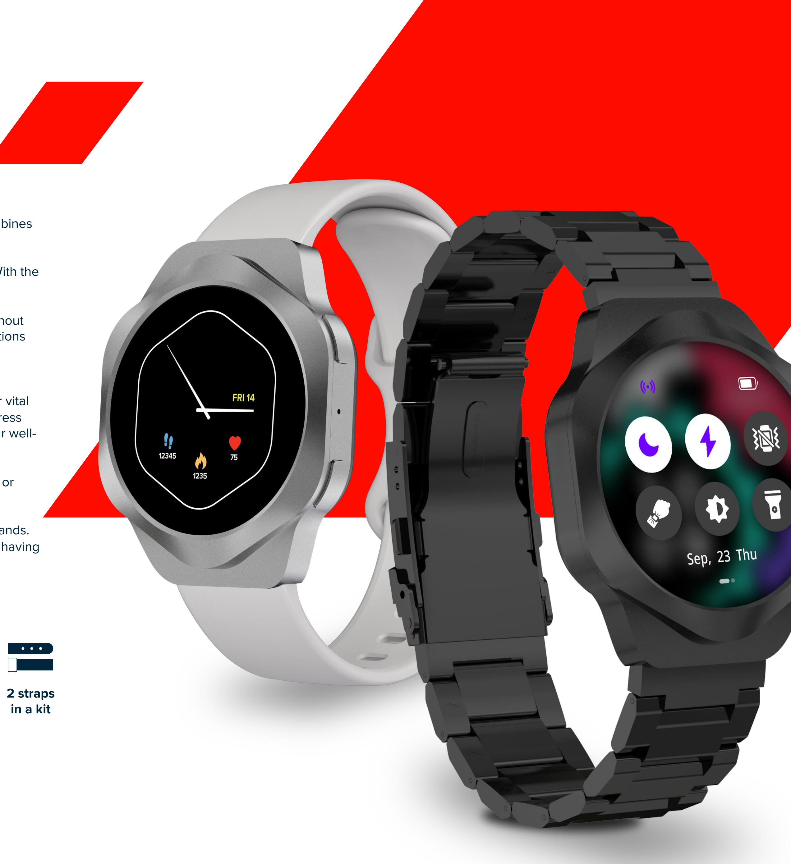
Sport modes 2 str in a